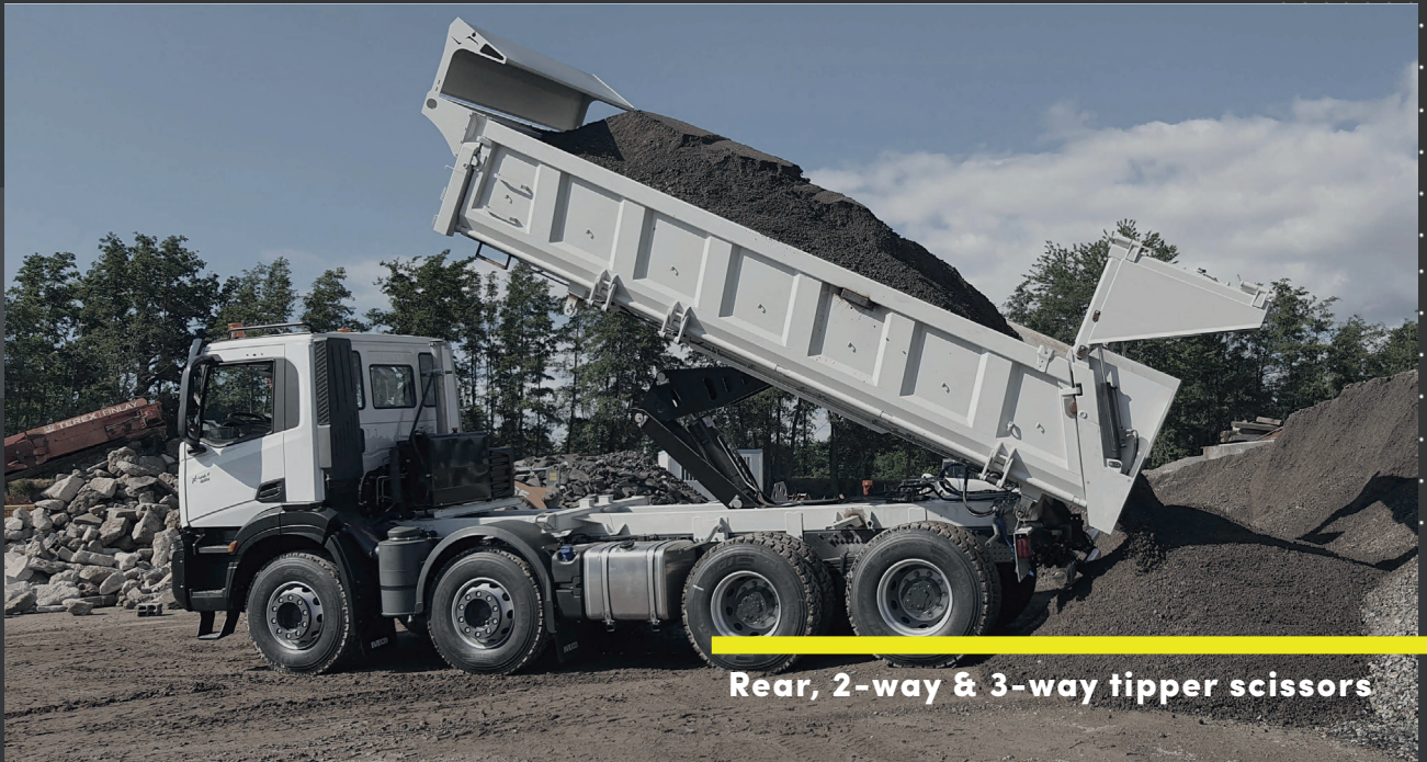
Rear, 2-way & 3-way tipper scissors